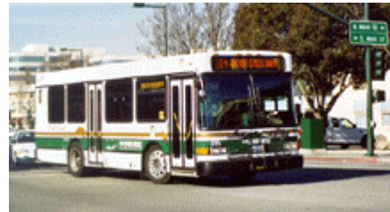
Free Ride downtown shuttle

The City of Walnut Creek subsidizes this service in the downtown area. The route runs from the Walnut Creek BART station to Broadway Plaza, stopping every other block at locations along Locust Street, Broadway Plaza, and Main Street. The Free Ride runs weekdays, 7 a.m. to 7 p.m. with 15-minute headways, and weekends between 9 a.m. and 6:30 p.m.